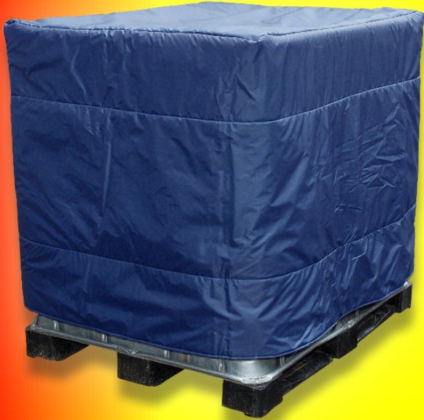
Item # 15-1740

Our insulation covers are designed in durable materials and in a construction that makes the cover easy to install to an IBC container.