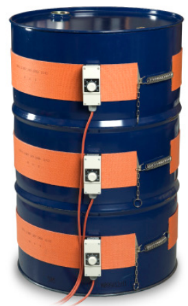
Item # 12-1208