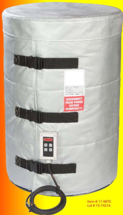
Item # 11-9870 Lid # 15-1921A

The drum heaters are designed in a durable and long lasting high quality lightweight design and the construction together with quick release webbing straps makes the drum heater easy to attach to any standard size drum.