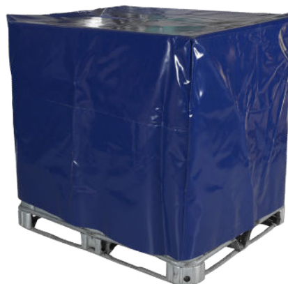
Item # 15-1738