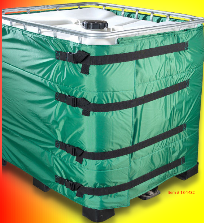
Item # 13-1432