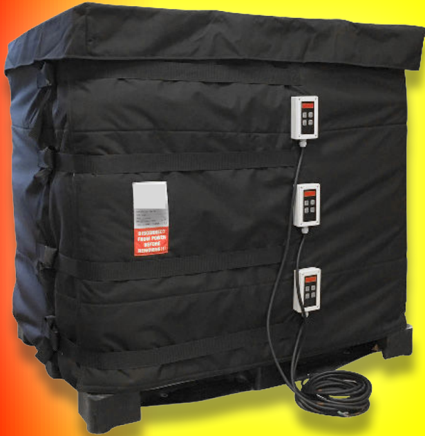
IBC Container Heating Performance Contents: Water