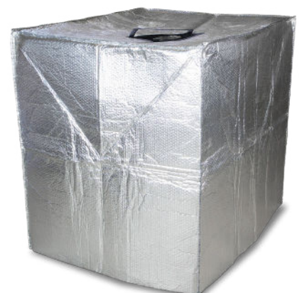
Item # 11-9861E