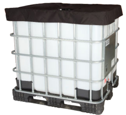
Item # 15-1733